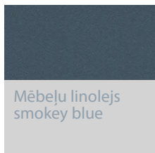
Mēbeļu linolejs smokey blue